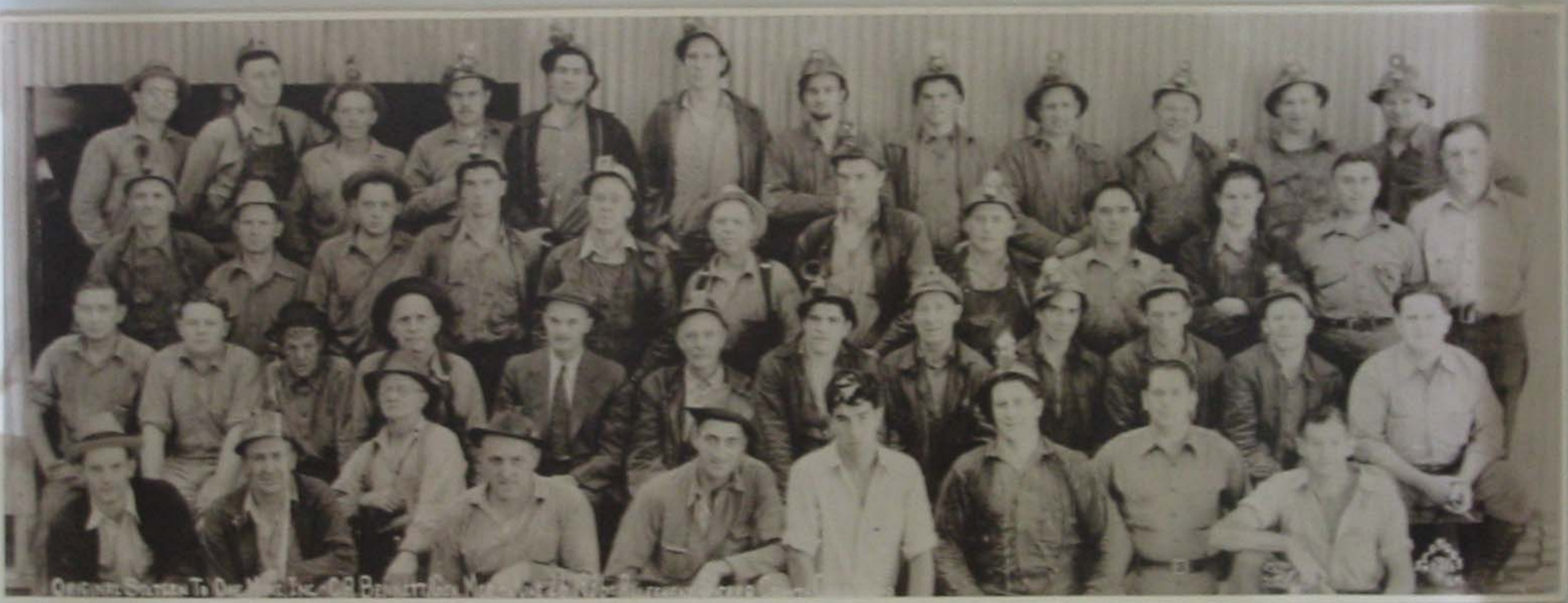
Company Sergeant To One Year Inc. Old Benetton Co. N.Y. 1918