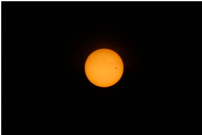
A month later, Venus made a transect of the Sun (that little dot at 3:00). This was mid-day so I took my camera to work and set it up near the parking lot for folks.