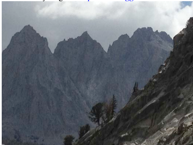
Storm clouds and steep granite; nice country!