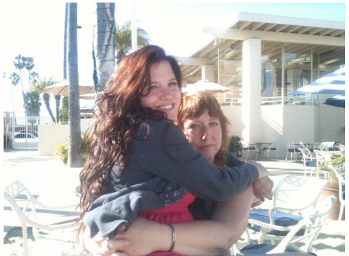
Oh yeah, that cute Mother-Daughter Act again