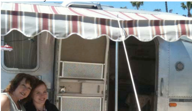
Mother-Daughter Act; they are such a cute pair.