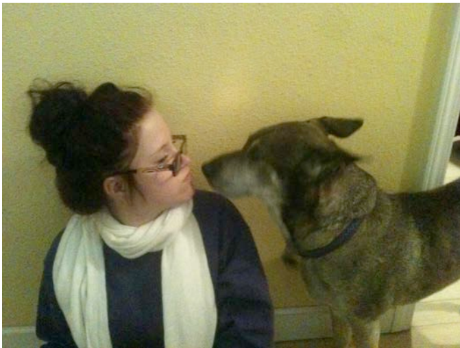
Jazz and Maurie.

One of the most difficult parts of going away to college, if you are a dog, is that you have to wait until visits to get kisses from Your Girl.