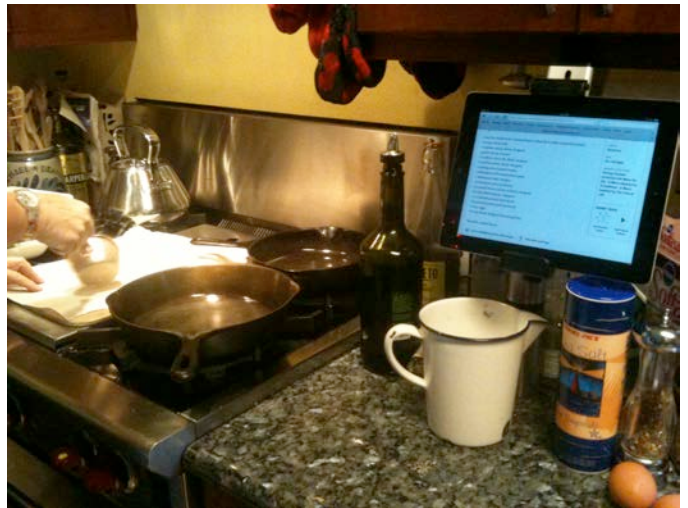
The stonework took many weekends, the cooking magic, meanwhile, was ongoing.

Inside the house, where the kitchen is the center of family life, we couldn't let the girls doing their iPadding get the better of us. We got an iPad bracket for the cabinet near the stove. The old technique was to print recipes so we didn't get the screen greasy. This is much better.