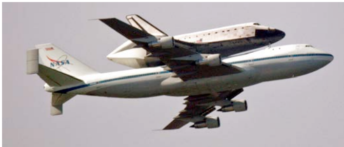
In September, the Endeavor made a flyby over the San Francisco Bay Area. I got this shot from the Emeryville mud flats

I worked the triennial U.S. Geological Survey Open House again this time around. We had several thousand people over the weekend. I put a photo essay of it online at http://www.diggles.com/openhouse2012/ .