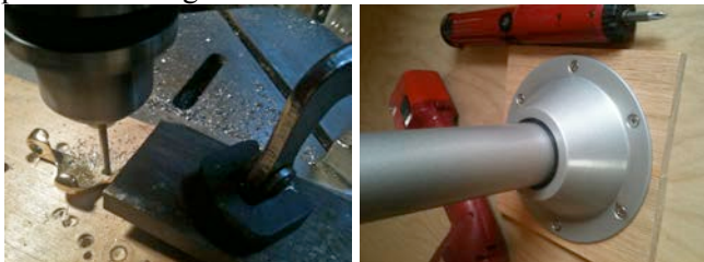
I got to use the drill press my Honey gave me for Christmas a few years back.

Before Maurie's Spring Break, we fixed a few more things on Button. The cabinets flew open and stuff ended up all over the floor when we hit bumps, the table leg was ready to collapse when Jazz bumped it, and it needed a new "period" awning.