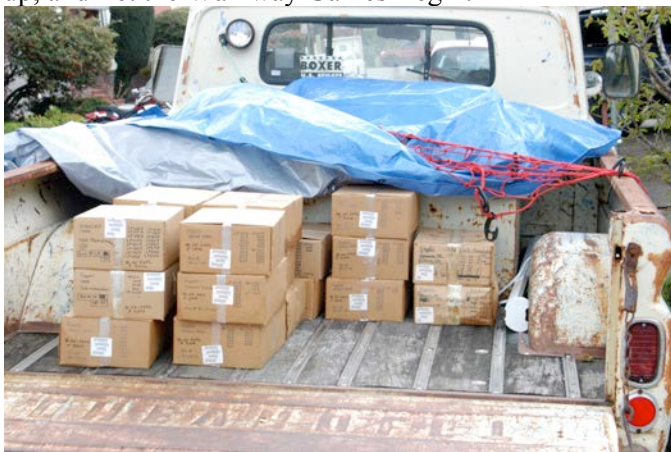
Fewer than 500 samples; these were just the trim stones.

I've been collecting rocks for a few decades now. In fact, I'm on my second fork-lift palate. A few hundred of them are slabs of granite I cut and analyzed and have long-since published the resulting geologic maps. So I drove my pickup truck (Hillary) down to the warehouse, loaded her up, and Let the Walkway Games Begin.