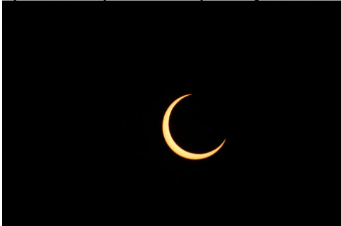
In May; a partial annular solar eclipse in my back yard.

Photography did play big this year, mostly having to do with things astronomical. Here are three semi-related topics. Oh, OK, you have to use your imagination a bit.