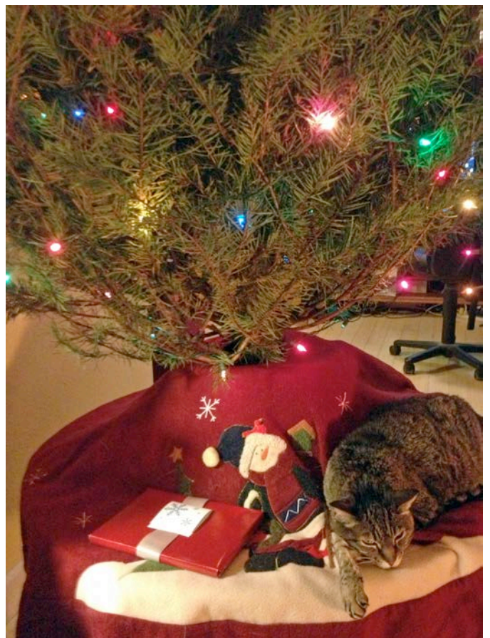
Oh, there she is.