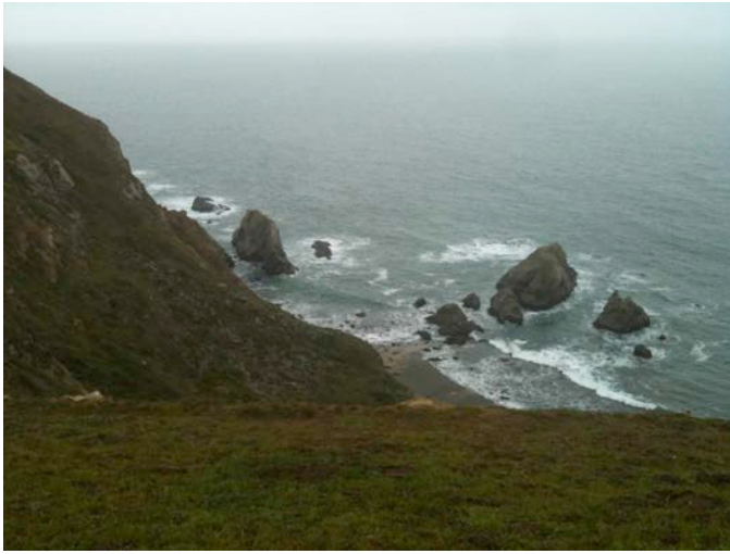
See those little lumps down there? They're over a thousand pounds each.

my other old friends, the Elephant Seals. I saw one of these two beaches up closer a few years back when some of us were out in a skiff working on a guy's thesis. But a long lens with a rain cover worked pretty well this time also.