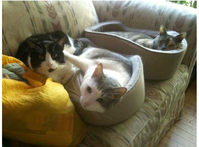
Wait; there's one cat missing.