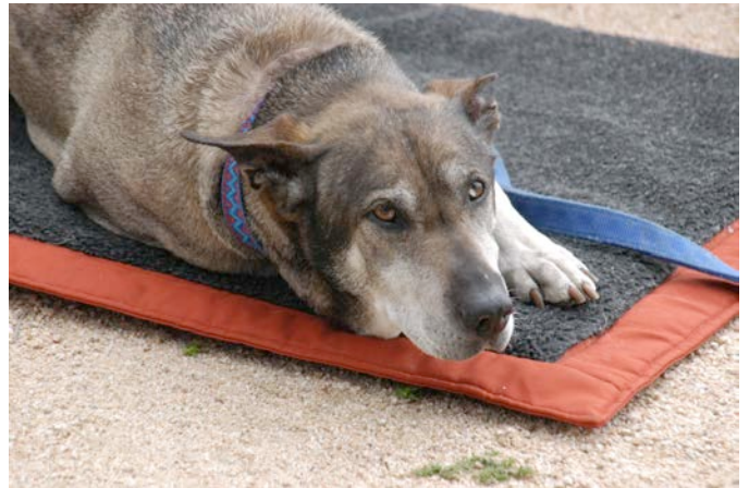
Jazz may look worried about competition but he's a con dog; he's well-loved.