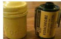
The last batch of processing took place early this year.

I was sad to have had to given up using Kodachrome to take these.