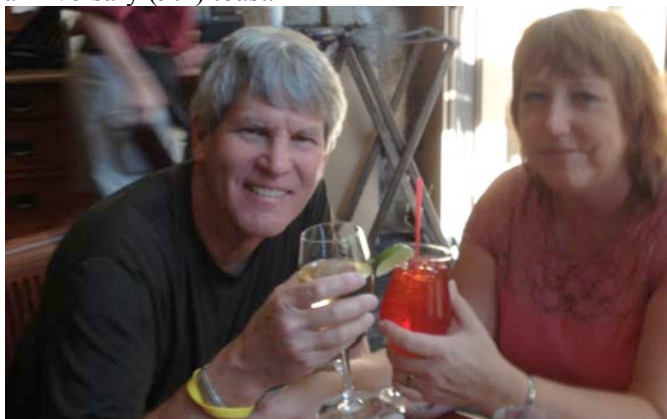
This is the same table where we got engaged in 2003.

The Yosemite trip with the sixty 11-year-olds has been put off until early 2013 due to hantavirus so we took Button to El Portal and hit the Ahwahnee for our anniversary (9th) toast.