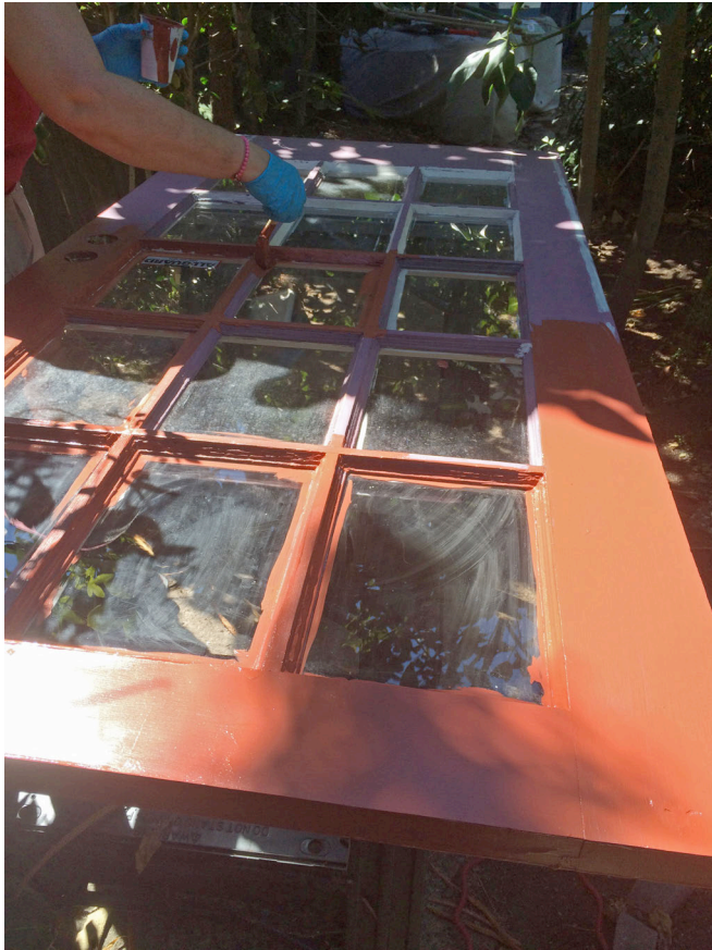
Fresh paint and some fresh window putty.