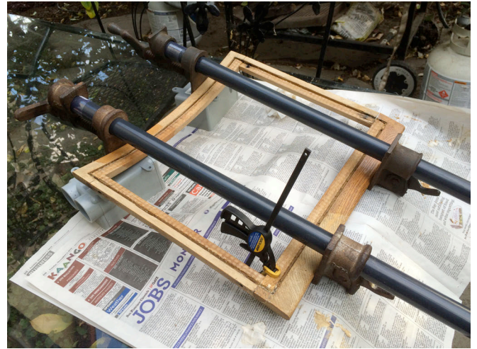
big and little clamps

A little woodwork and a pro shop for new caning added to the adventure