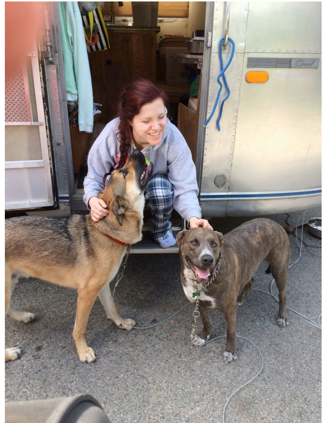
Bear, Maurie, Mattie, and Button.