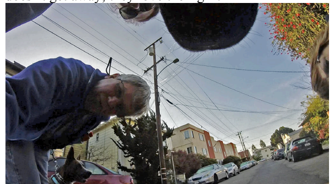
Irwin Court as Bear sees it.