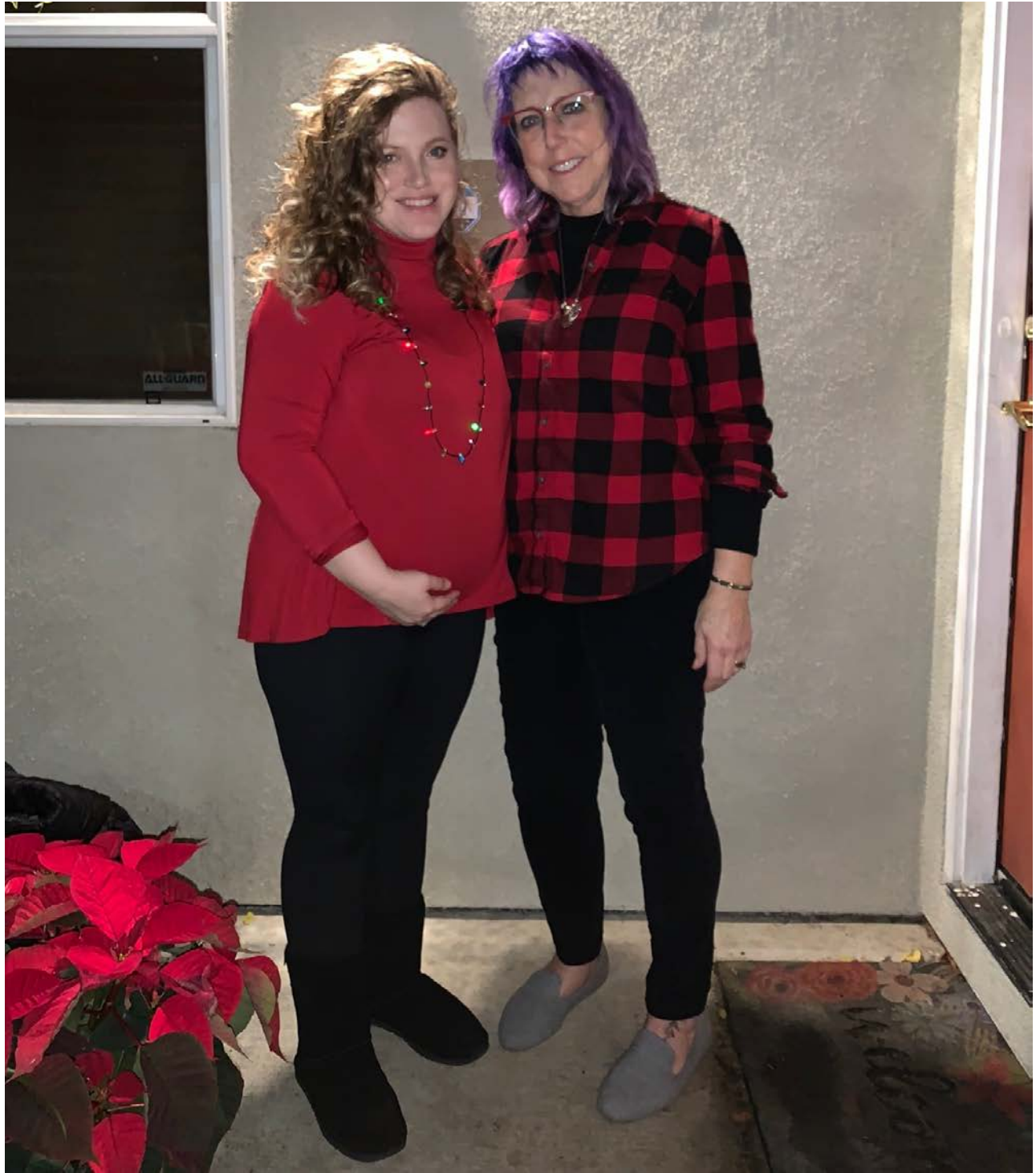
Mother and daughter with granddaughter due in March.

Have a safe and wonderful Christmas and New Year,