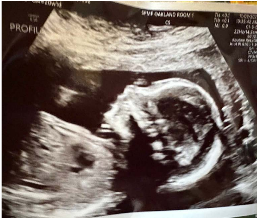
Here is her little head.