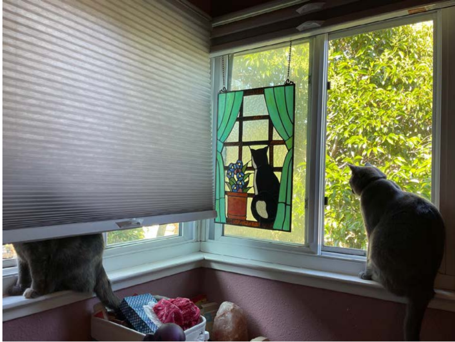
These cats know where to go by following the picture.

Winter means the hummers need food to stay warm.