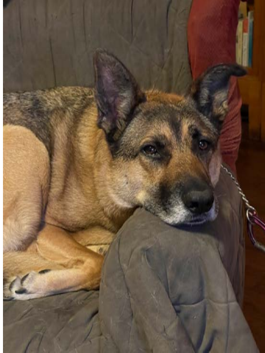
Bear thinks this easy chair is for him.

The dogs have their own ideas about which seats are OK for them.