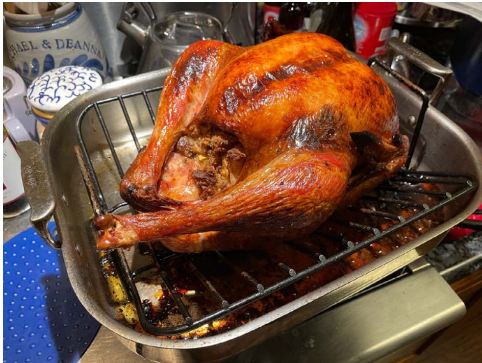
Nicely done turkey.