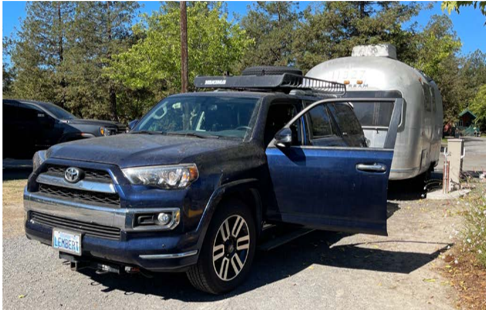
"Button," out vintage Airstream.

We took a little glamping trip for our anniversary.