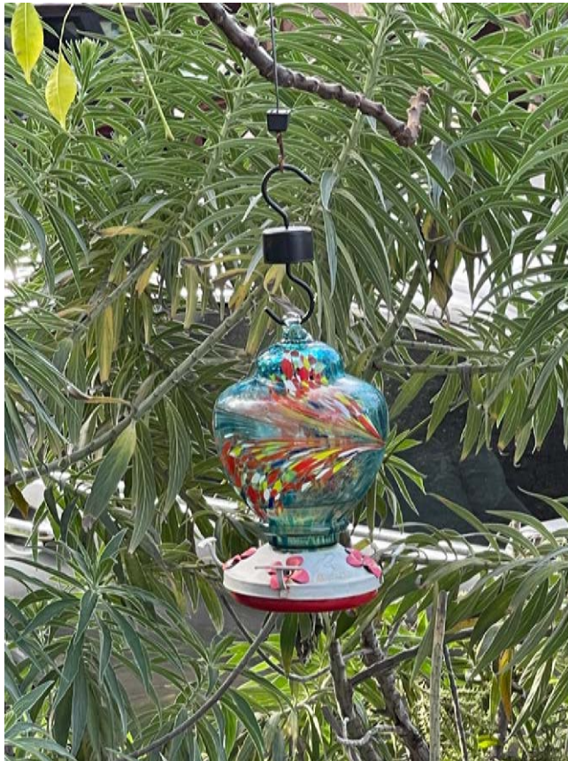
Deanna has a couple of these.

Winter means the hummers need food to stay warm.