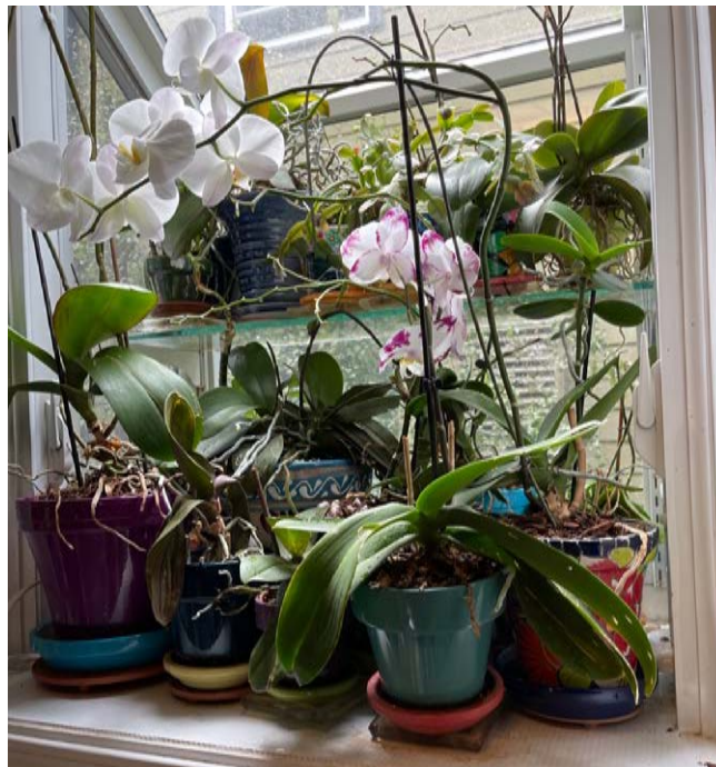
Deanna's greenhouse window.